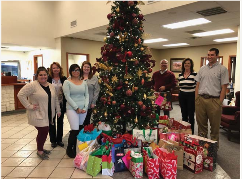
Gifts that were collected for the Adult Protective Services at the Big Spring Branch