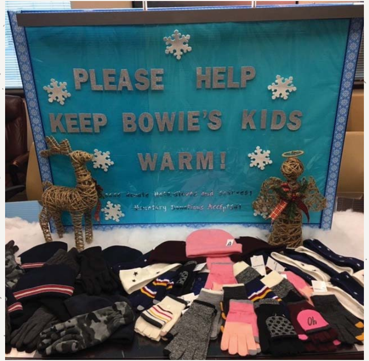
Western Bank donates gloves & beanies to Bowie Elementary children