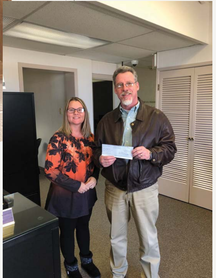
BSI ISD Community Card (Right)