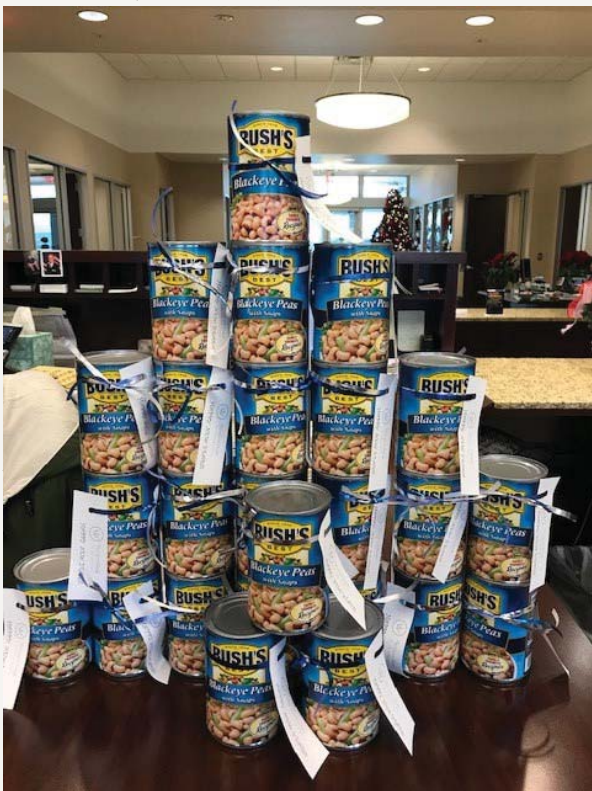
Abilene branch handed out black-eyed peas to their customers for luck for the New Year