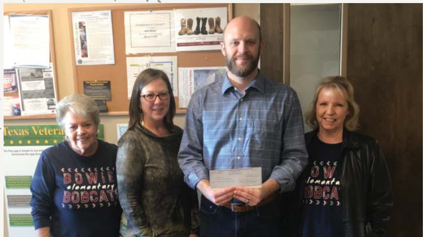
Abilene's Western Wednesday recipient was Taylor County Veterans Center. The center councils veterans & service men/women who come back from deployment to help them cope with returning to civilian life & also other issues like PTSD.