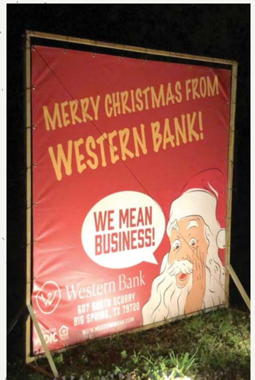
Festival of the Lights